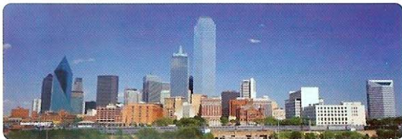
Houston has several distinctive skylines.

Local tours are normally 3 - 4 hours long, unless otherwise stated or arranged. Tours begin with an interactive 5 - 15 minute introduction, complete with historic documents and maps from the 1800s. All ethnic tours include visitations and or stops to historic religious institutions, walking tours of a cemetery, community centers, schools, old residences and mansions, restaurants, businesses, and more.